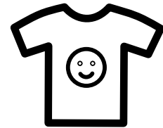
Large Chest or Rear max. height: 11in. (27cm)